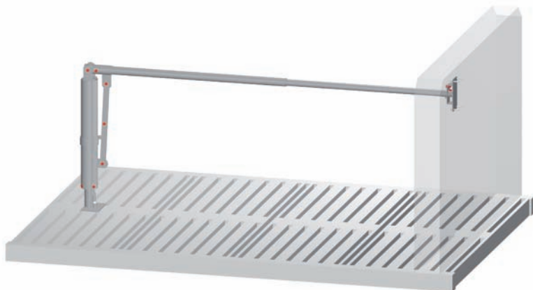
Barrier gate, spring loaded